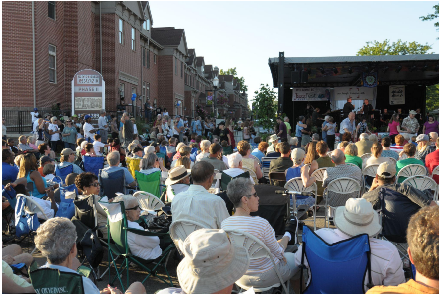
JazzFest Michigan Crowd