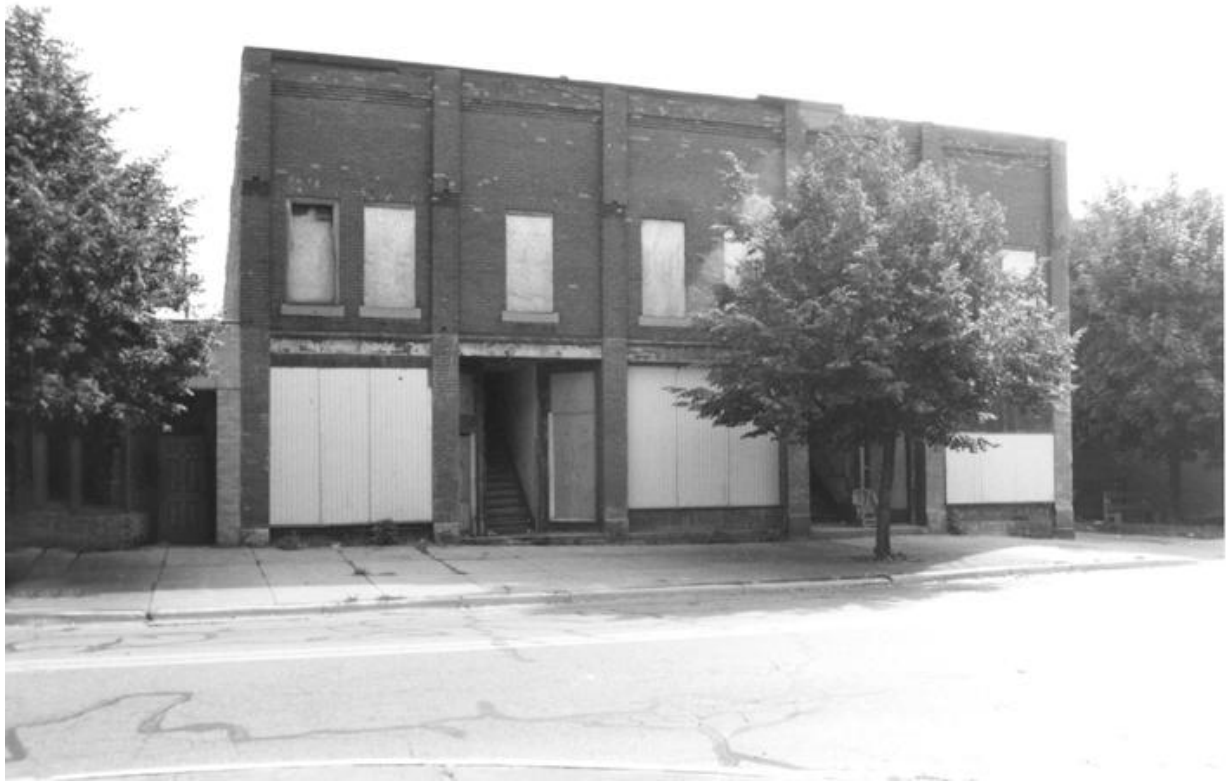
MICA Gallery Building (Before)