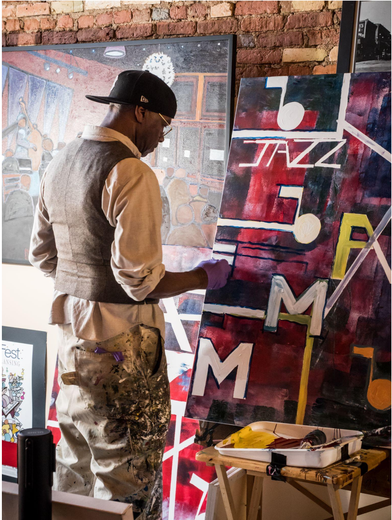
Live art