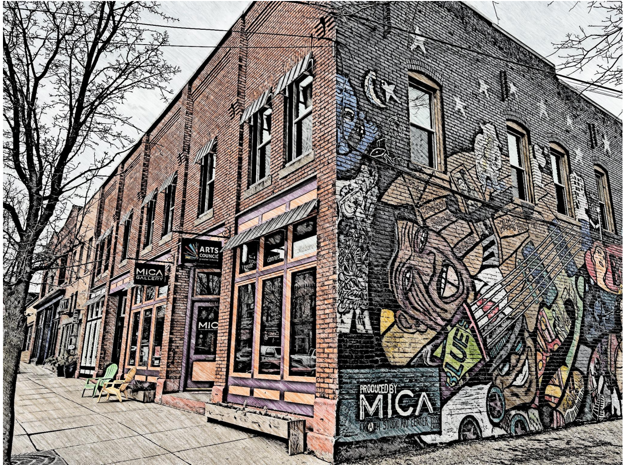
MICA Galler Building (After)