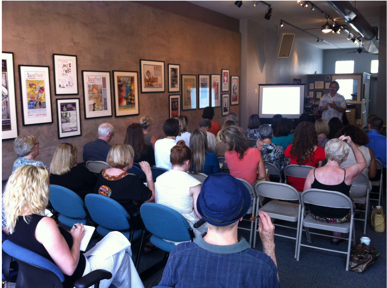
MICA Gallery presentation