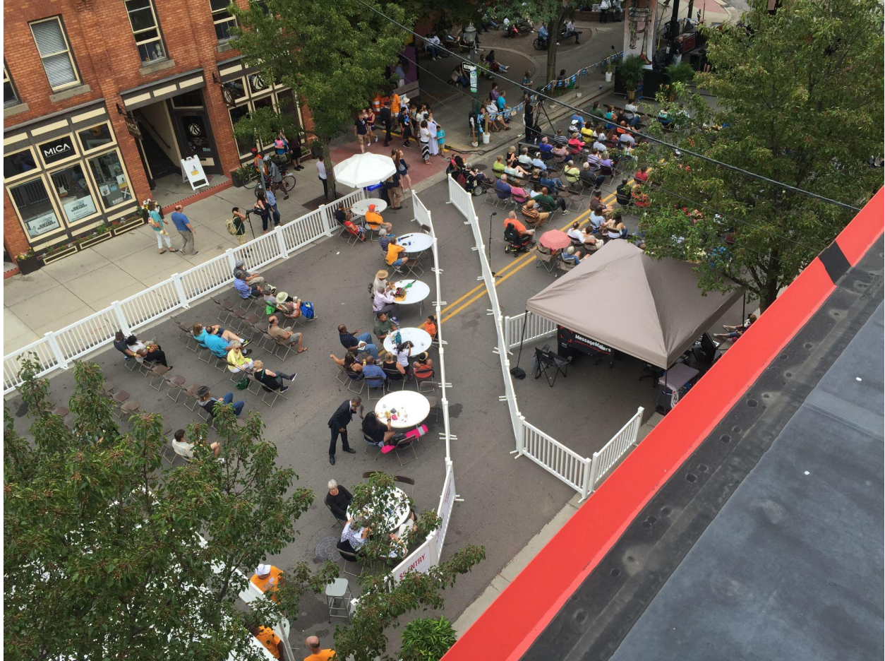
JazzFest Michigan Festival from a rooftop