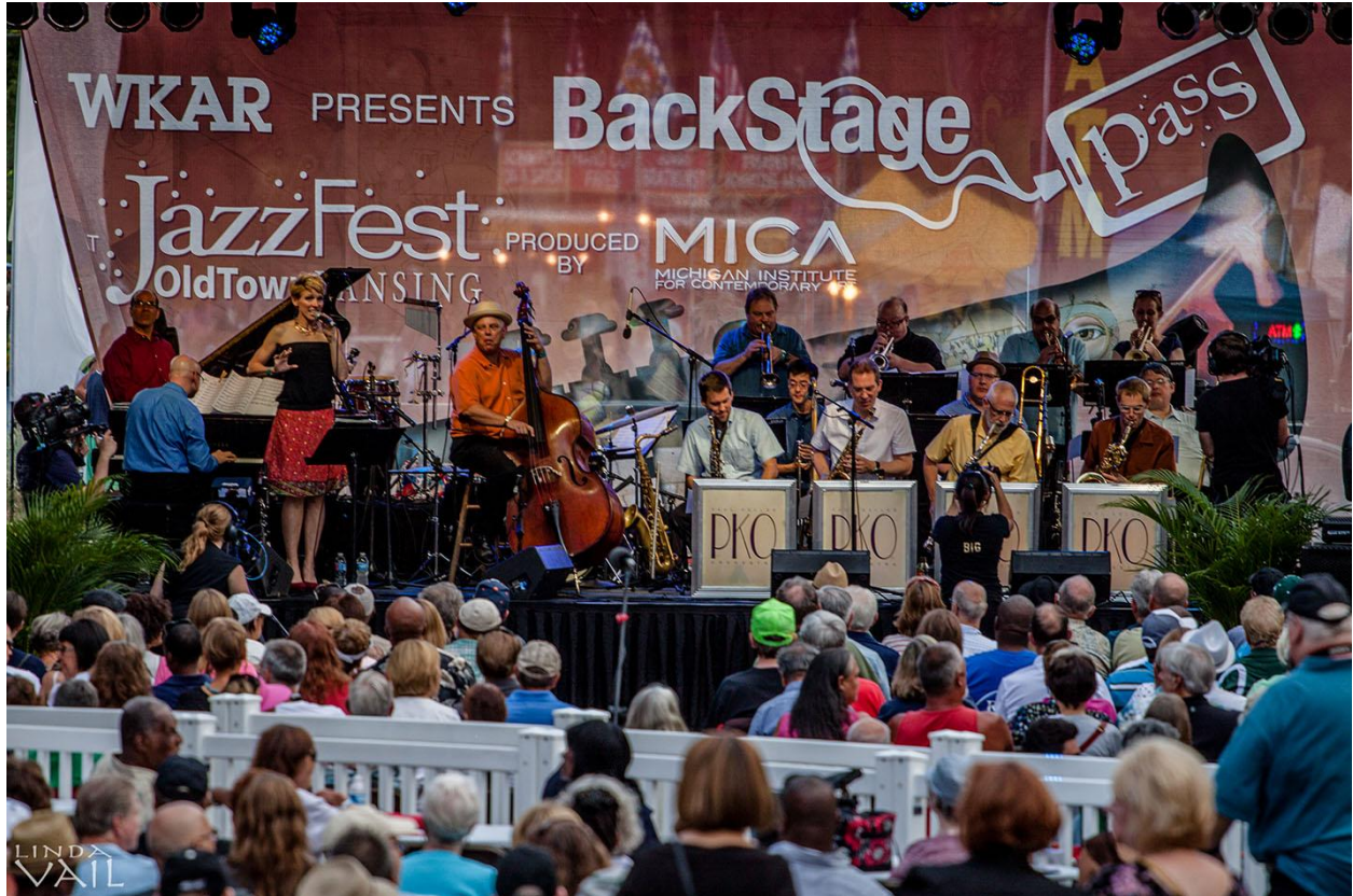
JazzFest Michigan band