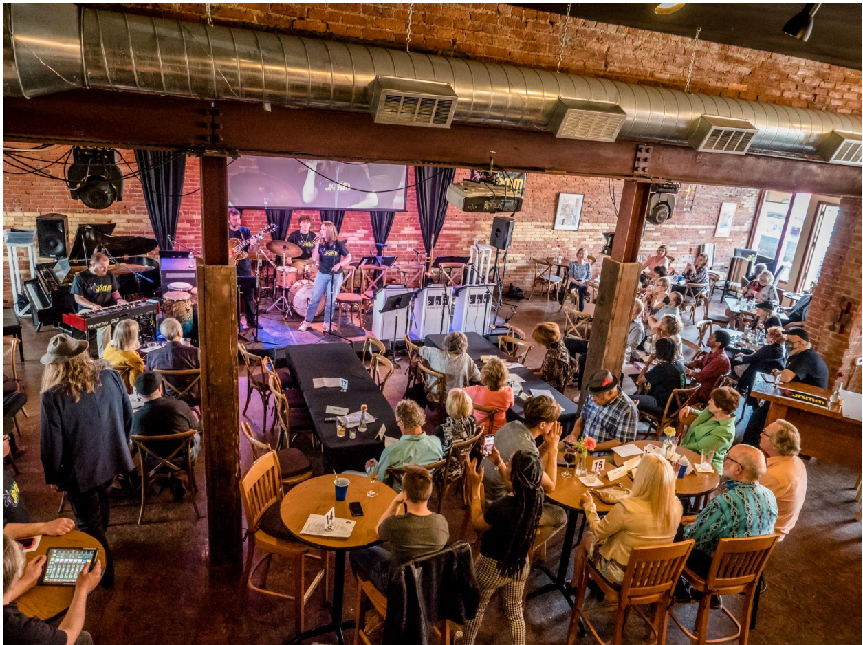
The crowd at UrbanBeat on 4/23