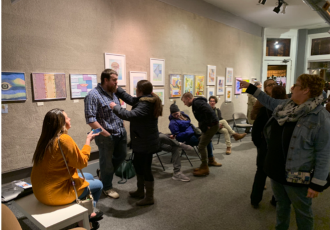
MICA Gallery Artist Reception